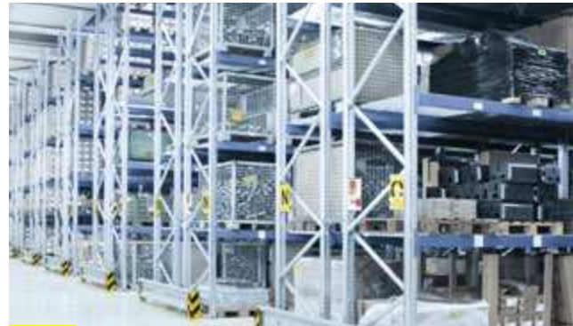
3 MANUAL AND SEMI-AUTOMATED SYSTEMS FOR LARGE LOAD CARRIERS