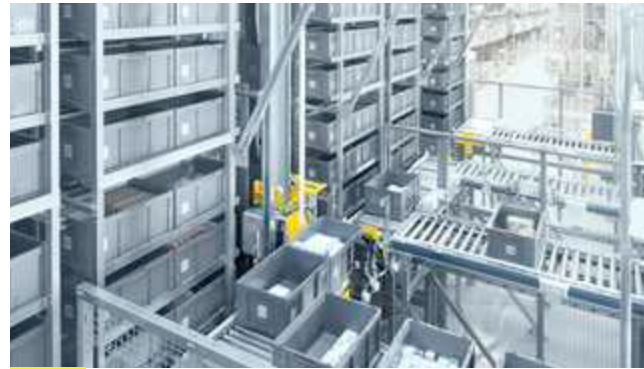
2 SEMI- AND FULLY AUTOMATED MINILOAD SYSTEMS