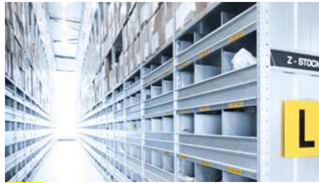
1 MANUAL SYSTEMS FOR SMALL LOAD CARRIERS

WAMAS ® With our in-house developed WAMAS® logistics software, we combine intralogistics components to create an intelligent overall system. Clear visualizations and comprehensive tools manage processes, resources, and stock levels, ensuring efficient warehouse operation.